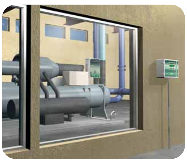
Gas Monitor Remote Display located outside of mechanical room provides entry way signaling.